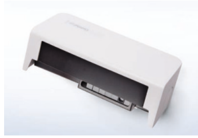
CertiRef<sup>™</sup> and LinSet<sup>™</sup> modules

Automated performance verification module with certified standards, compliant with Ph. Eur. and USP.