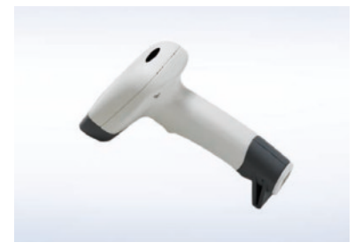
Hand-held bar code reader (USB), Biometric instrument login with LogStraight™ fingerprint reader.