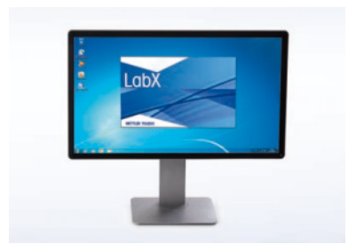
LabX® UV/VIS PC Software

Full instrument control, FDA 21 CFR part 11/EU annex 11 compliance and system integration.