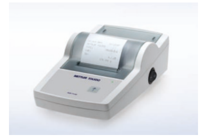
USB-P25, -P56, -P58 compact printer and HP and EPSON protocol network