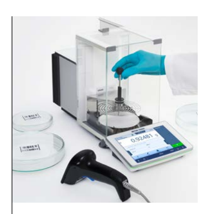
Fast, easy balance conversion With a comprehensive range of accessories you can turn your balance into the perfect filter weighing solution.

Particulate matter on filters as small as 0.1 µg can be quickly and accurately determined in accordance with strict automotive and environmental requirements.