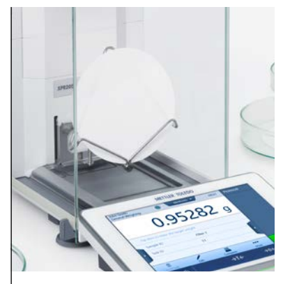
Environmental monitoring Assemble the filter kit on your XPR analytical balance within seconds. Kits are ideal for routine work, particularly using large filters up to 150 mm. They allow samples to be weighed quickly and accurately.