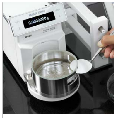
Emissions determination The XPR ultra-micro balance equipped with a filter kit for filters up to 70 mm determines particulate matter on filters weighing as little as 0.1 µg.